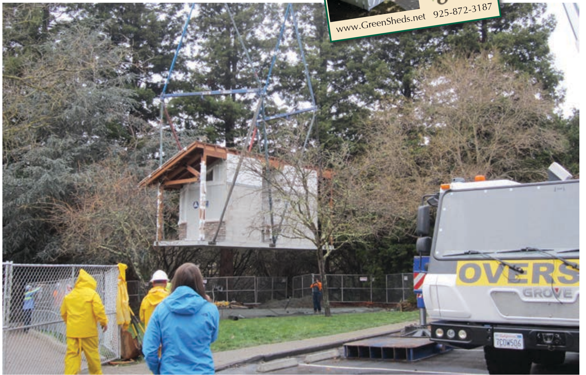
Moraga Commons Park takes delivery of new restroom facility.